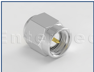
P/N:01235435 SMA(M) S/T Plug To MHF-I&II Receptacle