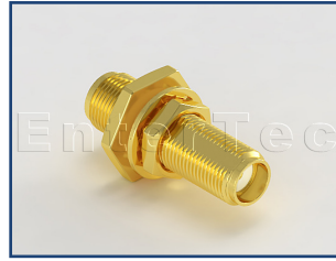
P/N:06431535 SMA(F) S/T Bulkhead Jack With O-Ring To SMA(F) S/T Jack