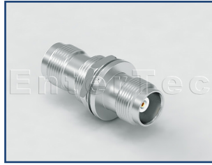
P/N:06237835 TNC(F) S/T Bulkhead Jack To TNC(F) S/T Jack