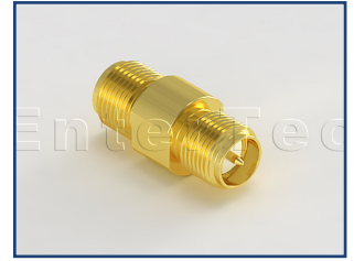
P/N:05234335 SMA(F) S/T Jack To SMA(F) S/T R/P Jack