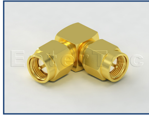
P/N:05237135 SMA(M) R/A Plug To SMA(M) R/A Plug