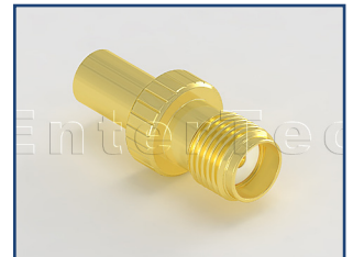
P/N:10430435 SMA(F) S/T Jack To SSMB(F Contact) S/T Plug