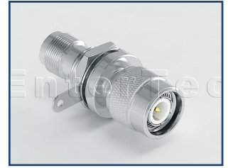
P/N:78435535 TNC(M) S/T Plug To TNC(F) S/T Bulkhead Jack With Solder Tag