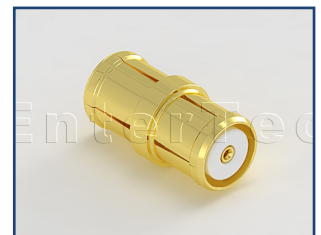
P/N:10430635 SMP(F Contact) S/T Plug To SMP(F Contact) S/T Plug