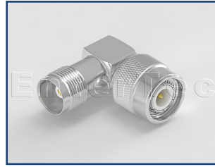
P/N:06430135 TNC(M) R/A Plug To TNC(F) R/ A Jack