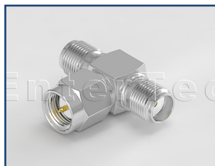
P/N:13233935 SMB(M Contact) S/T Bulkhead Jack To SMB(M Contact) S/T Jack