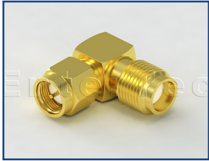
P/N:05230235 SMA(M) R/A Plug To SMA(F) R/A Jack