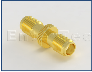
P/N:13435735 SSMA(F) S/T Jack To SSMA(F) S/T Jack