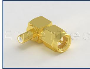
P/N:78435135 SMA(M) R/A Plug To SMB(M Contact) R/A Jack