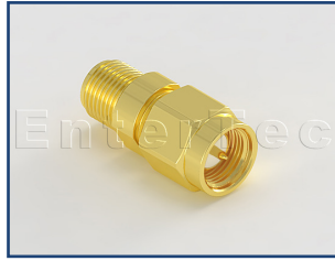
P/N:05438835 SMA(M) S/T Plug to SMA(F) S/T R/P Jack