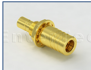
P/N:10239435 SMB(M Contact) S/T Bulkhead Jack To SMB(F Contact) S/T Plug