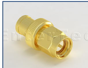
P/N:07232835 SMA(M) S/T Plug To SMB(F Contact) S/T Plug