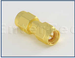
P/N:07232835 SMA(M) S/T Plug To SMA(M) S/T Plug