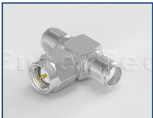
P/N:06434235 SMA(F) Jack To SMA(M) Plug To SMA(F) Jack T-Angle