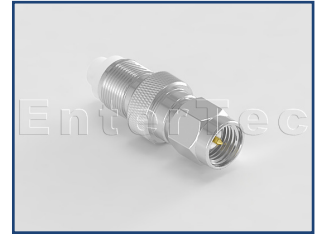
P/N:06430935 SMA(M) S/T Plug To FME(F) S/ T Jack Adaptor