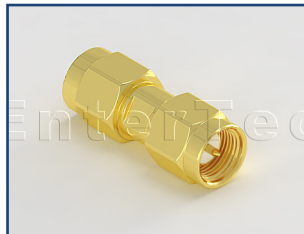
P/N:07232835 SMA(M) S/T Plug To SMA(M) S/T Plug